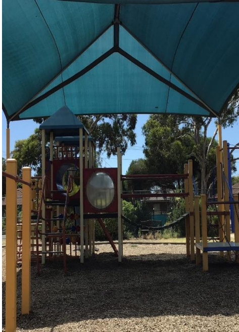
on the Prep playground,