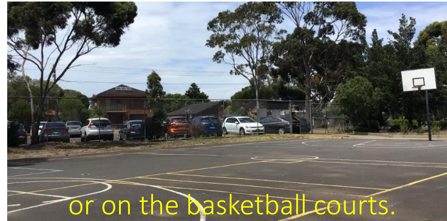
or on the basketball courts.