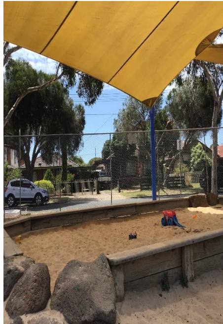
in the sandpit,