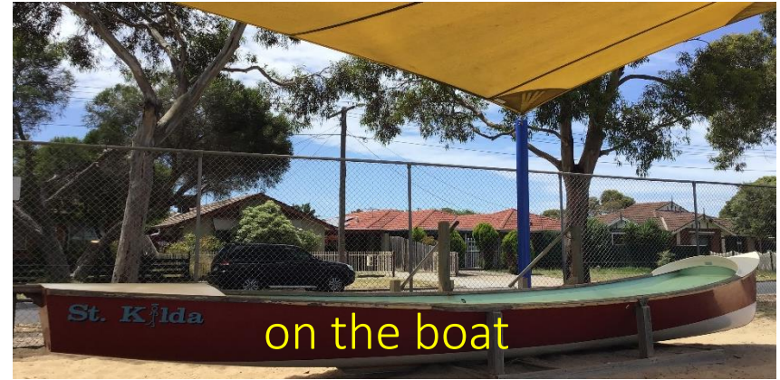
on the boat